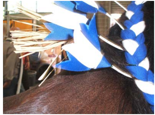
Above – Cedars Majestic