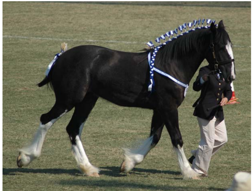
Above Right – the intricate Shire mane plait & flights