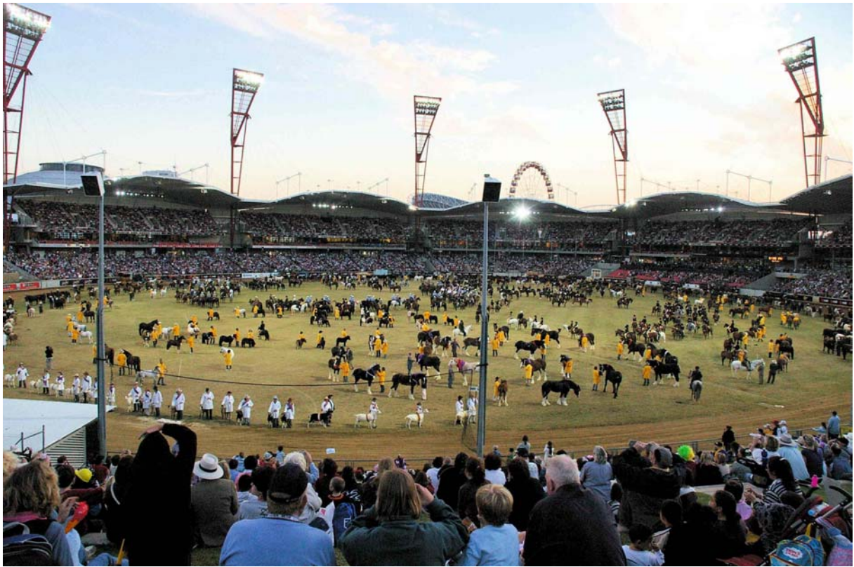
Above - The spectacle of the Grand Parade