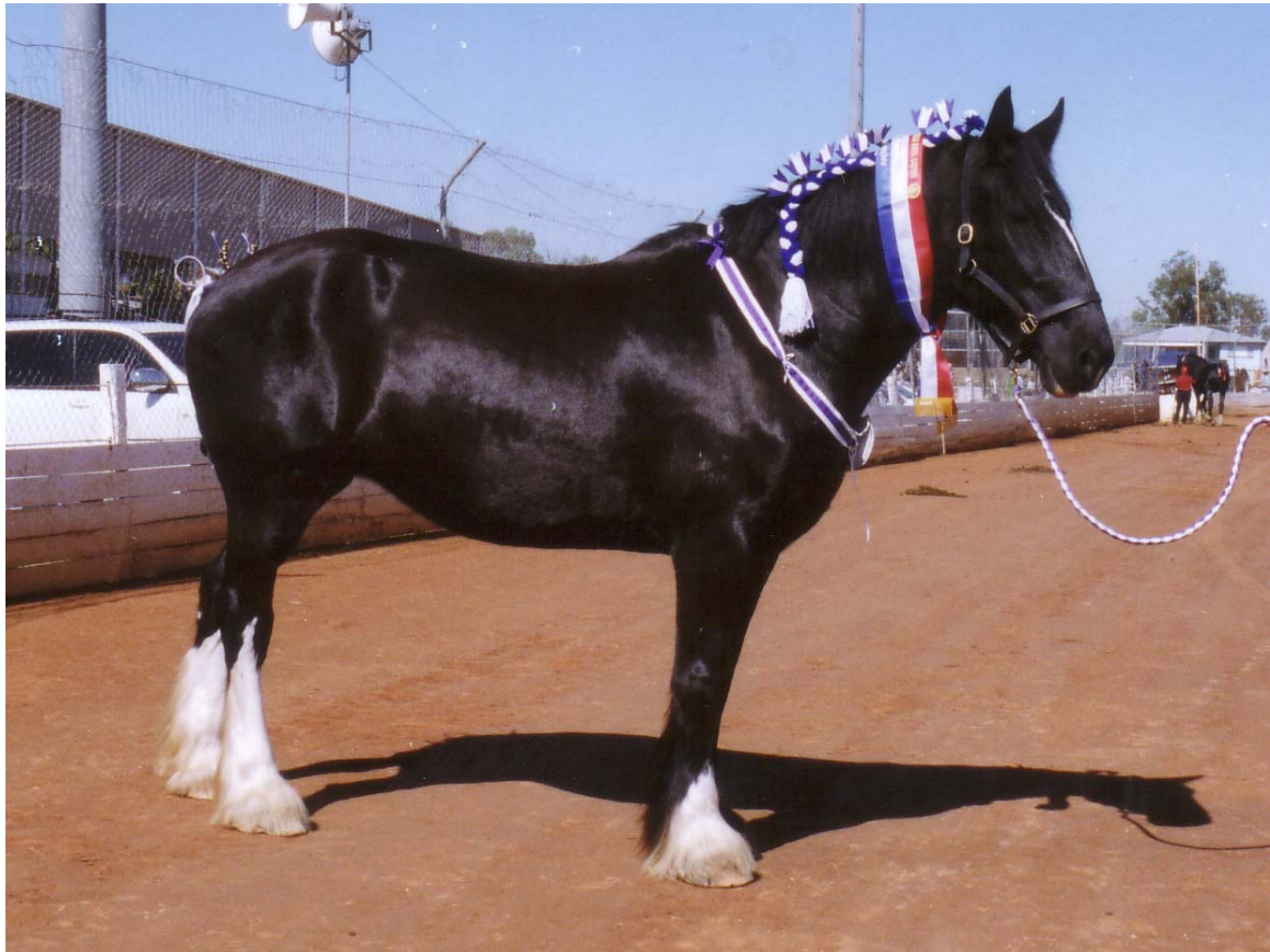
Wye Bonnie Lass Supreme Champion Shire Winner of the Supreme All Breeds Led Exhibit