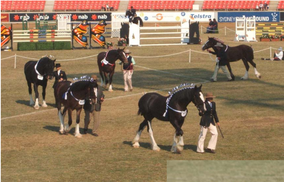
Shire Filly 2yr & Under Class