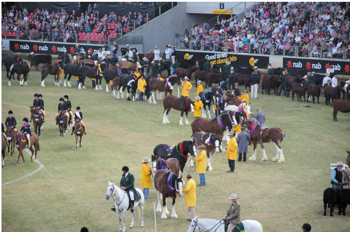
Below – the Heavy Horses in the Parade